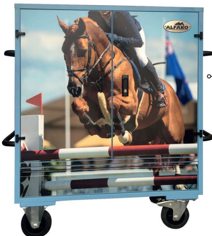
TACK LOCKER TAPED WITH INDIVIDUAL PHOTO