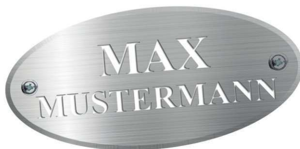
TACK LOCKER WITH ADDITIONAL COMPANY LOGO OR RIDER'S NAME