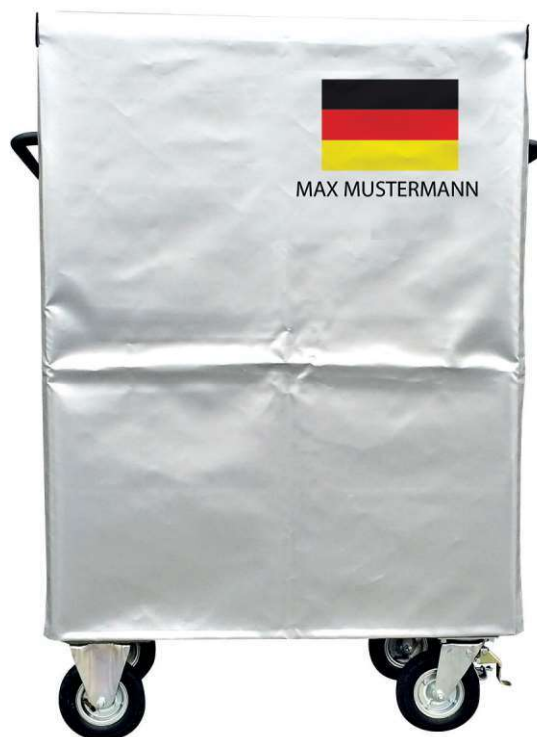
TACK LOCKER WITH A PROTECTIVE COVER WITH A FLAG AND NAME OF THE RIDER