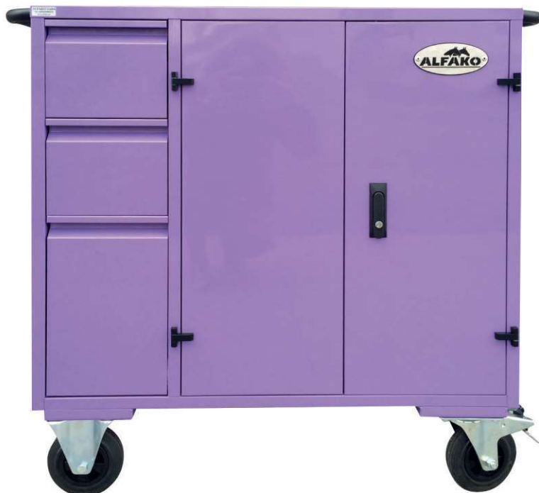
TACK LOCKER IN A NON-STANDARD COLOUR